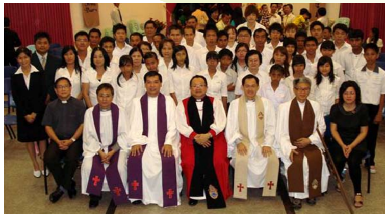
40 from Christ the Cornerstone, Tarakan were confirmed on 15th - 17th December.