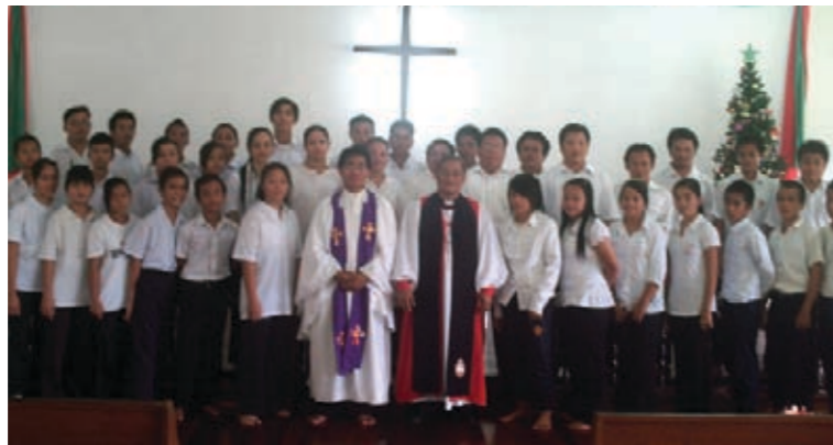
37 from St Augustine's Mission District, Merotai were confirmed 18th December.