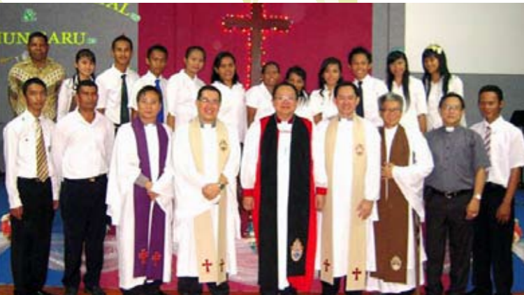
14 from Church of Christ the King of King, Nunukan were confirmed on 15th December.